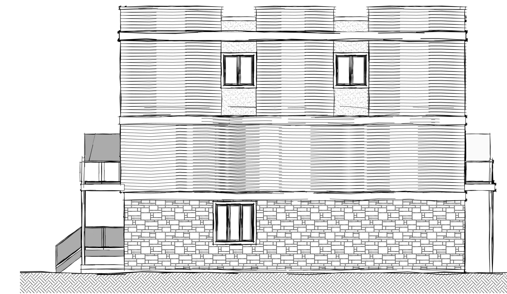
2 RIGHT SOUTH SIDE ELEVATION 1/8" = 1'-0"