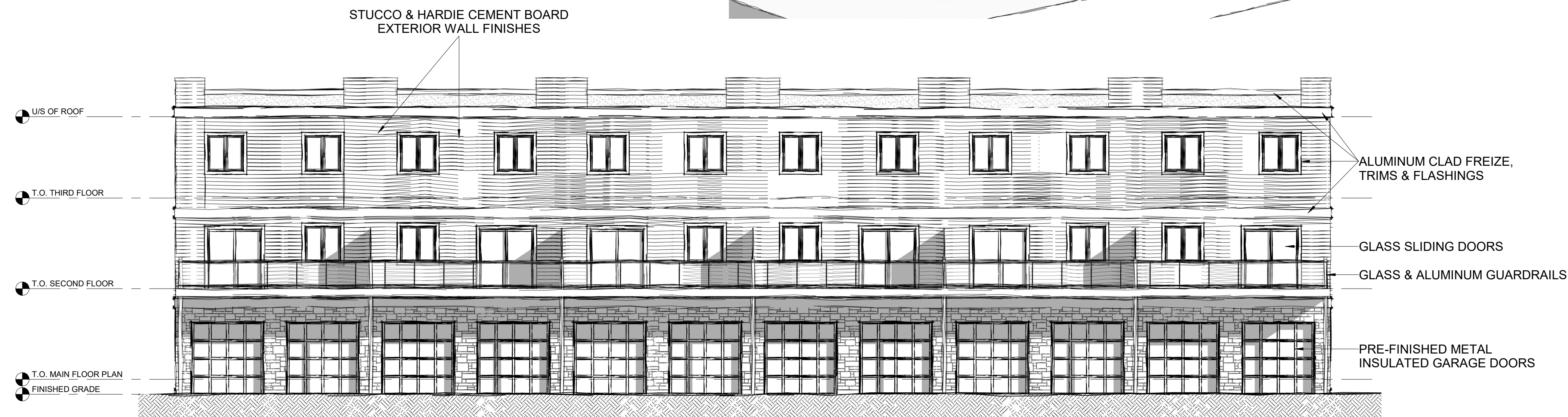
3 REAR EAST SIDE ELEVATION 1/8" = 1'-0"