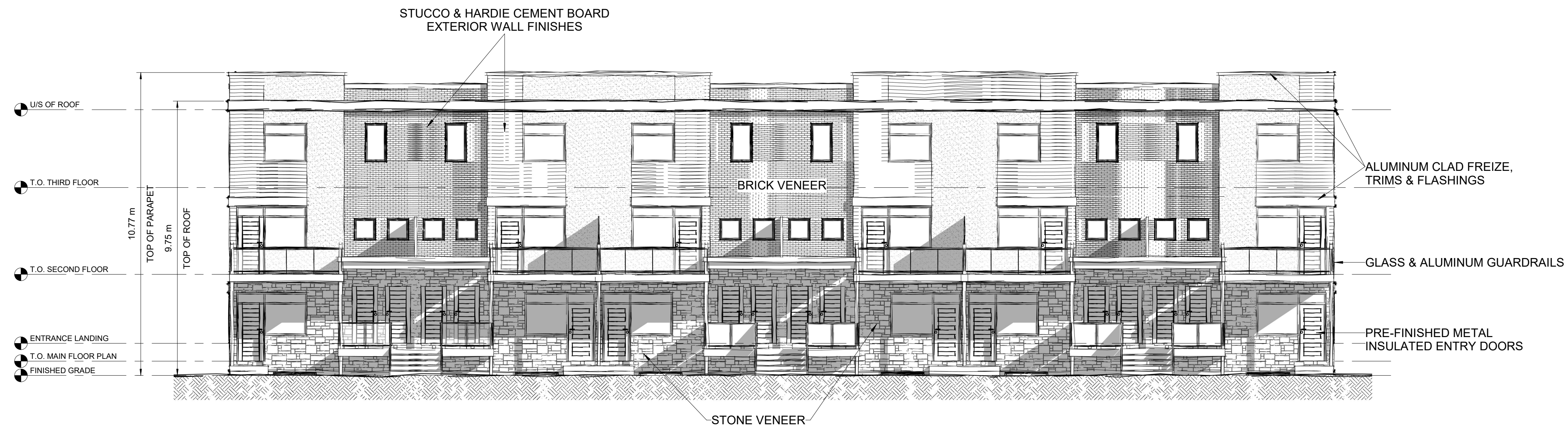
1 FRONT WEST SIDE ELEVATION 1/8" = 1'-0"