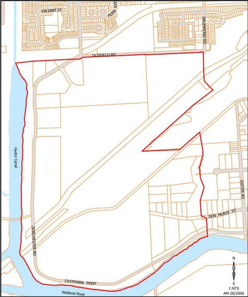
Thundering Waters Secondary Plan Area