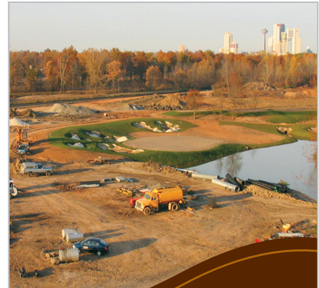
Thundering Waters Golf Course

Planning & Development / Business Development 4310 Queen Street P.O. Box 1023 Niagara Falls, ON L2E 6X5 (905)356-7521 Ext. 4238 (905)356-2354 Fax www.niagarafalls.ca