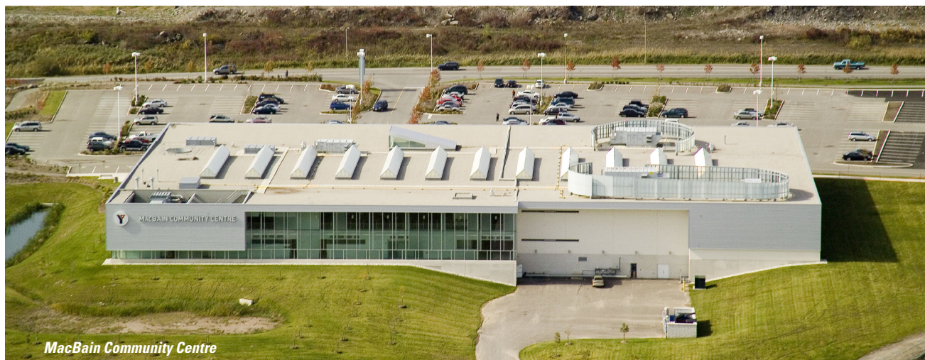
MacBain Community Centre

Property owners of brownfield sites can apply for funds under the programs. To determine if you are eligible, review the program summaries in this pamphlet. Individuals should contact the Community Improvement Program Coordinator to discuss the details of making an application of the programs. The program guide and applications are contained on the City's web site at www.niagarafalls.ca .