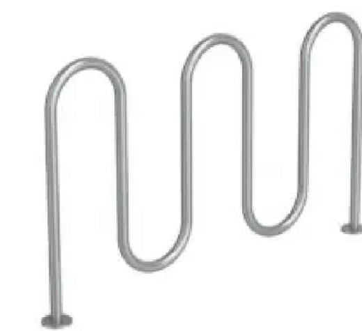
BIKE RACK DETAIL