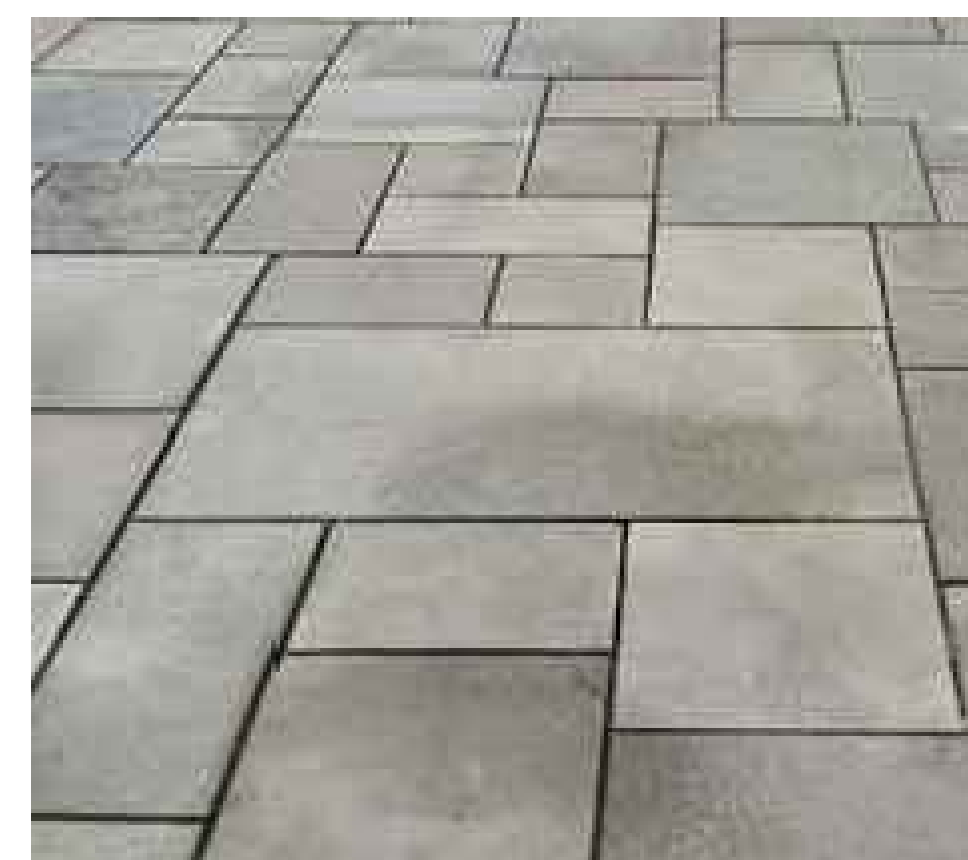
SQUARED LIMESTONE FLAGSTONE