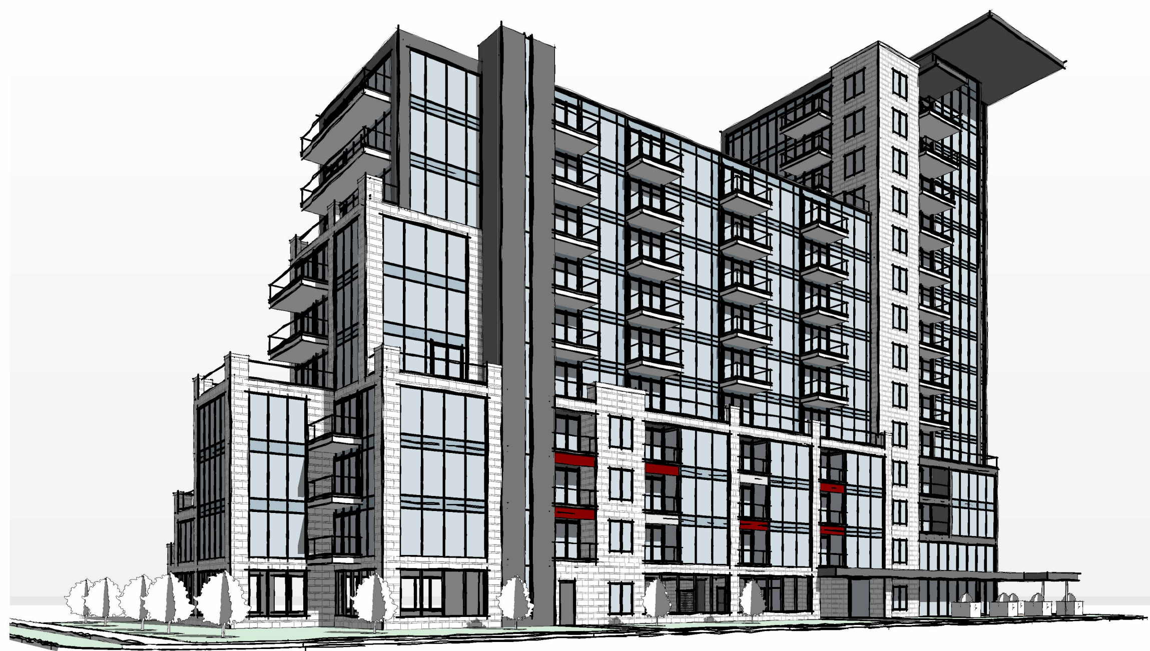
SOUTH EAST PERSPECTIVE