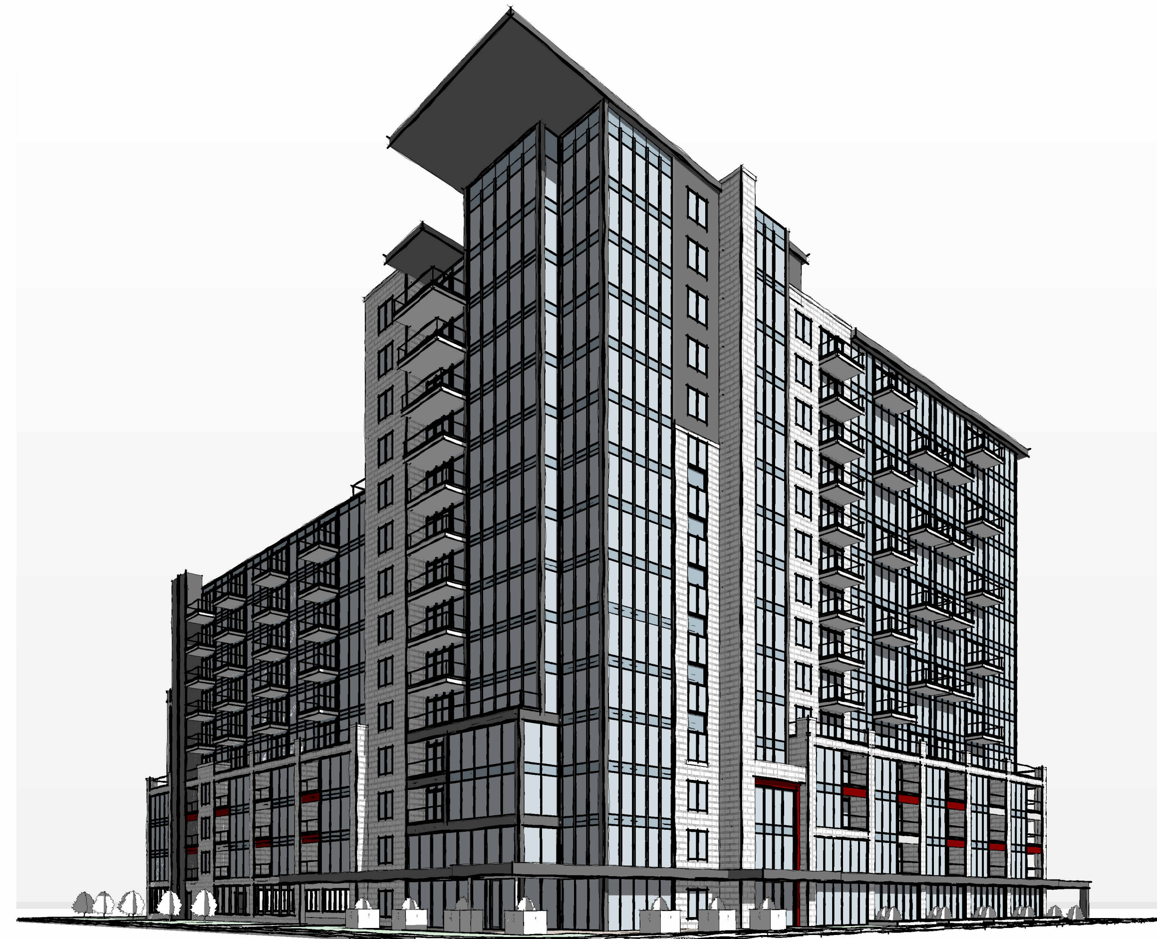
SOUTH WEST PERSPECTIVE