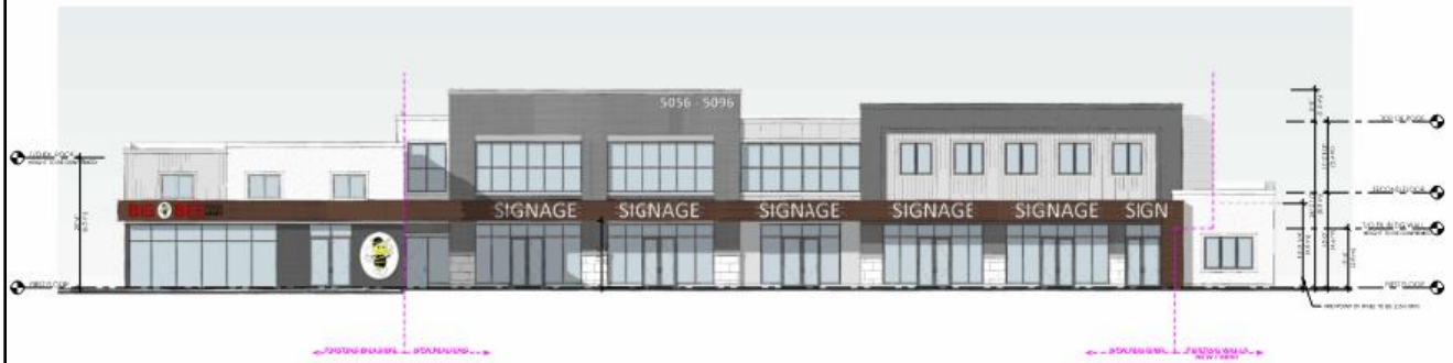
FRONT ELEVATION (MONTROSE ROAD)