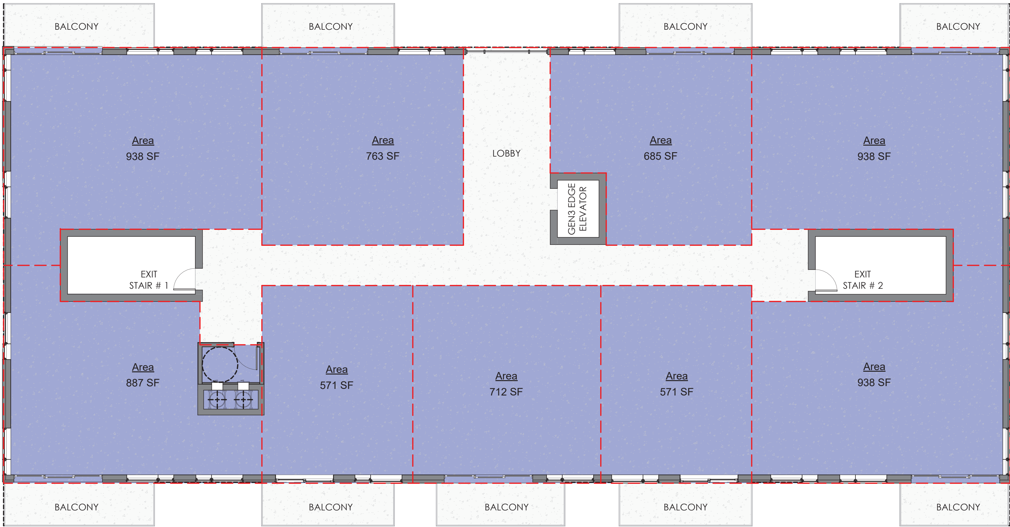
BUILDING A 2ND - 4TH FL. PLATES 1 : 100

UNIT STATISTICS (FINAL UNIT COUNTS AND SQUARE FOOTAGES TO BE DETERMINED AT DESIGN DEVELOPMENT STAGE