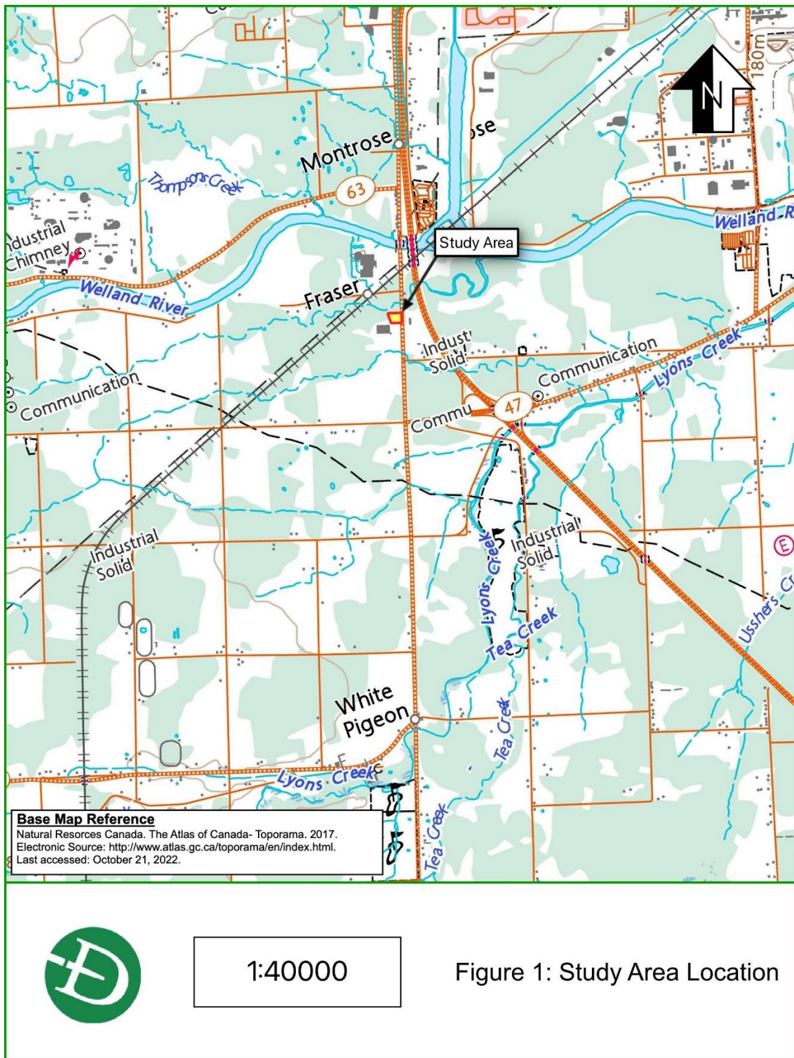
Figure 1: Study Area Location