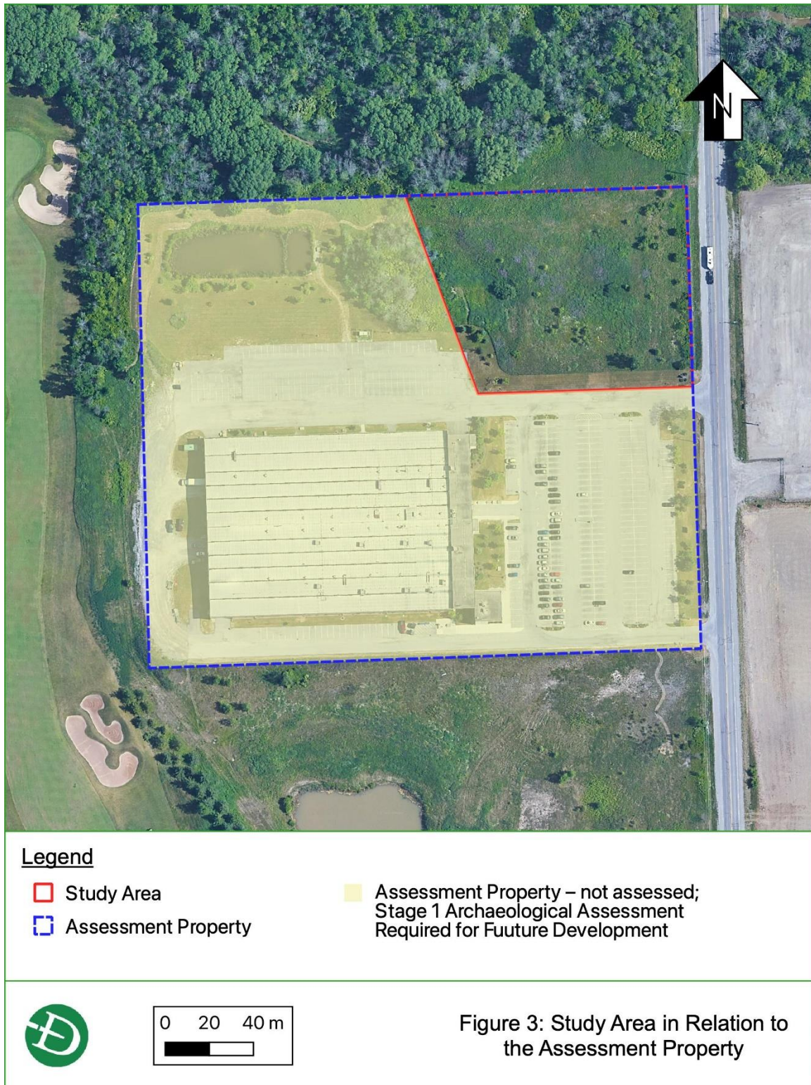
Figure 3: Study Area within Assessment Property