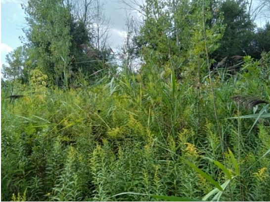
Photo 7: Overgrown greenspace, Test Pit Surveyed, from Northwest corner looking south