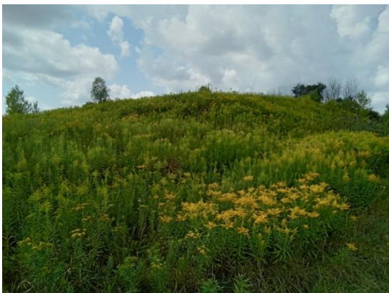
Photo 5: Large clay hill, disturbed, not assessed, looking southwest