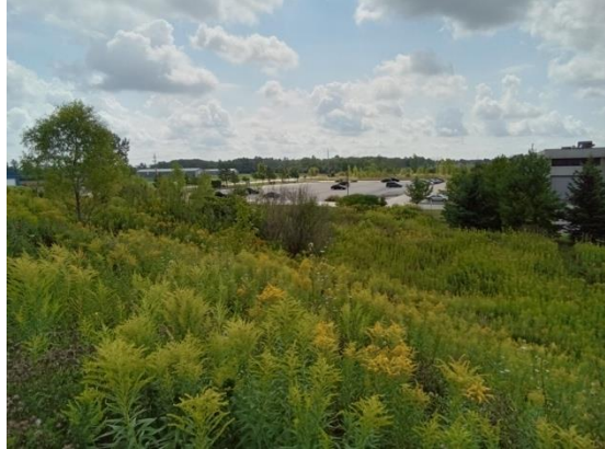
Photo 8: Top of large clay hill, disturbed not assessed, looking south toward parking lot