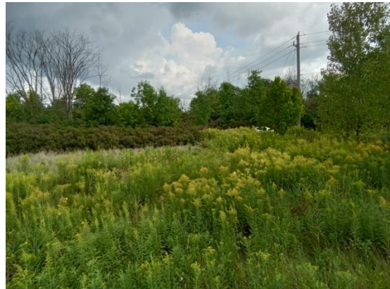
Photo 4: Overgrown greenspace, Test Pit surveyed, looking east toward Montrose Road