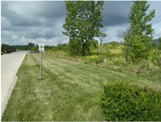
Photo 1: Manicured lawn, Test Pit Surveyed, from southeast corner looking northwest along edge of parking lot