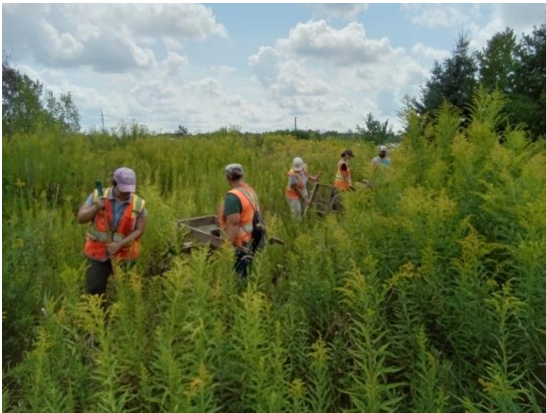
Photo 9: Overgrown greenspace, Test Pit Surveyed, looking southeast