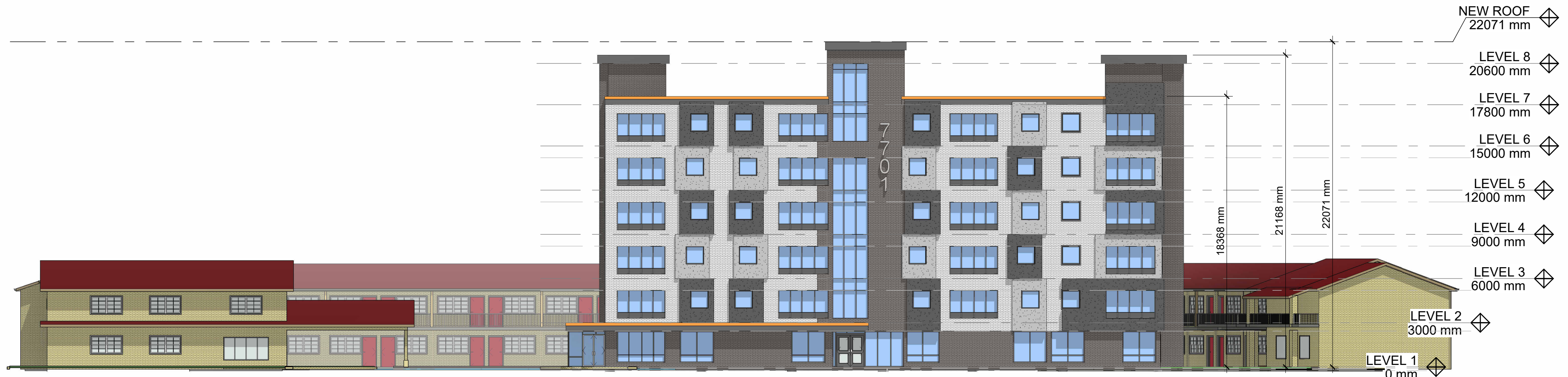
3 South Elevation 1 : 200