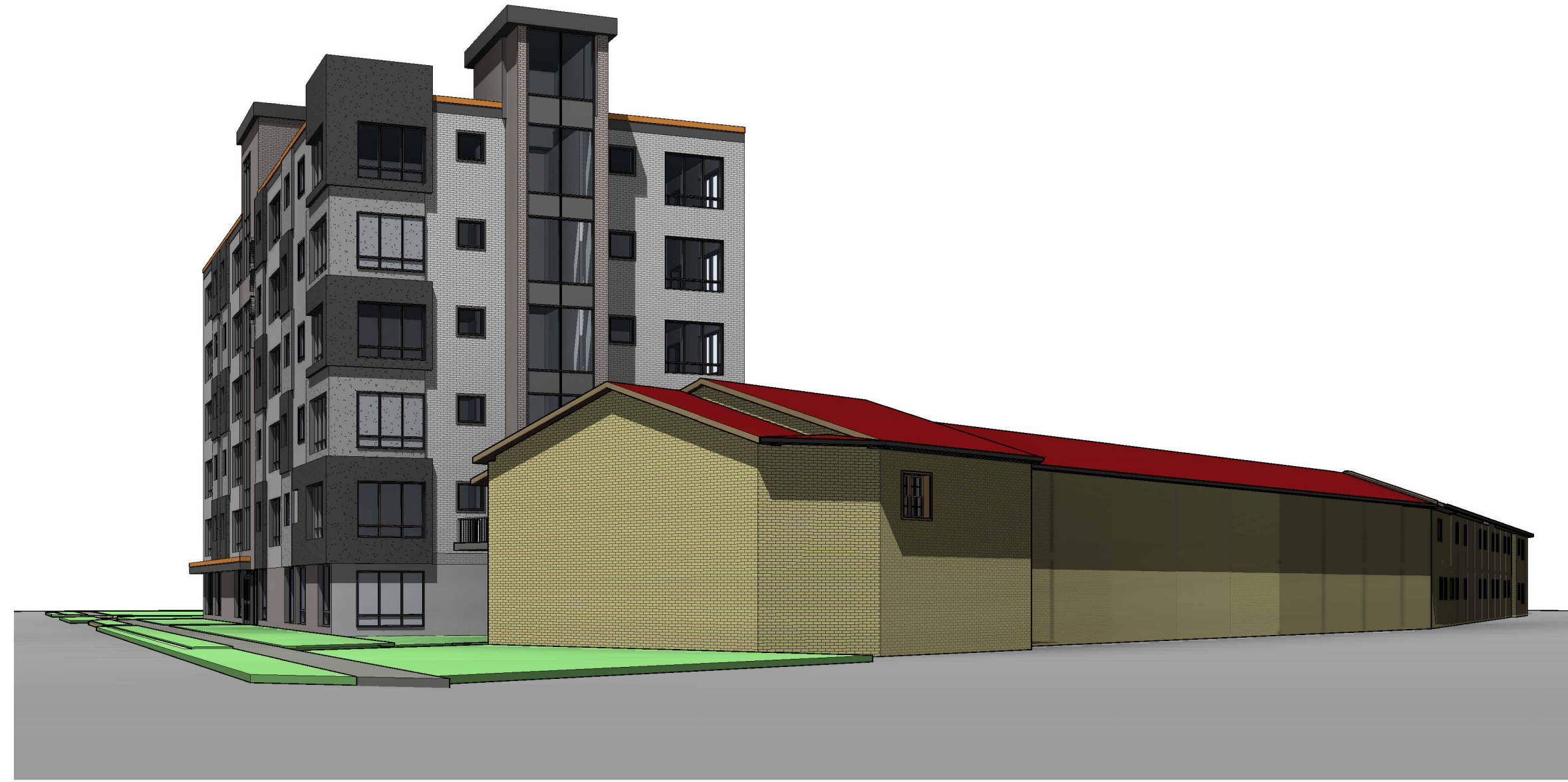
1 East Elevation 1 : 200