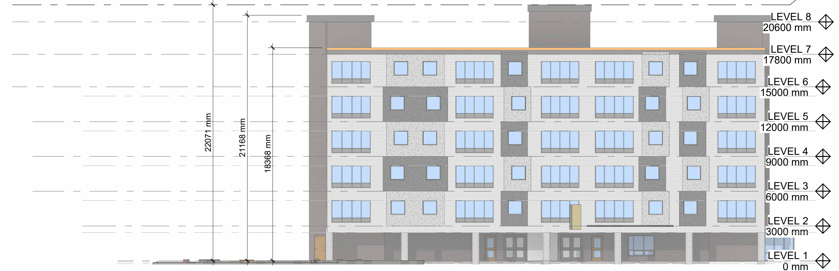
2 North Elevation 1 : 200