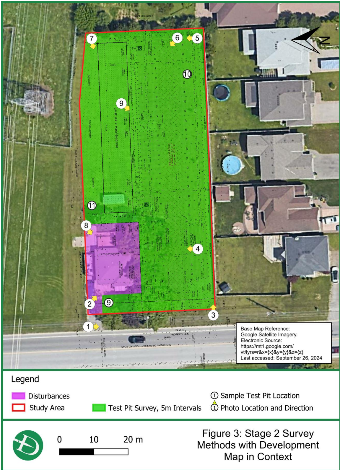
Figure 3: Stage 2 Field Methods Map