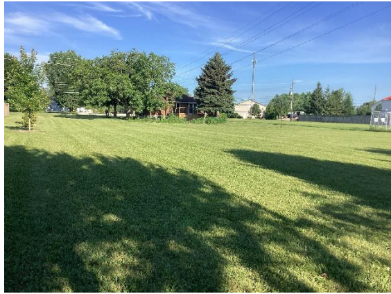
Photo 6: Manicured Lawn, Test Pit Surveyed at 5m Intervals, southeastern corner looking northwest