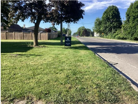
Photo 1: Manicured Lawn, Test Pit Surveyed at 5m Intervals, northwest corner looking east