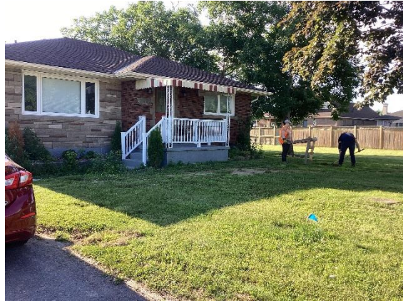
Photo 2: House, Previously Disturbed; Manicured Lawn, Test Pit Surveyed at 5m Intervals, northeastern corner looking southeast