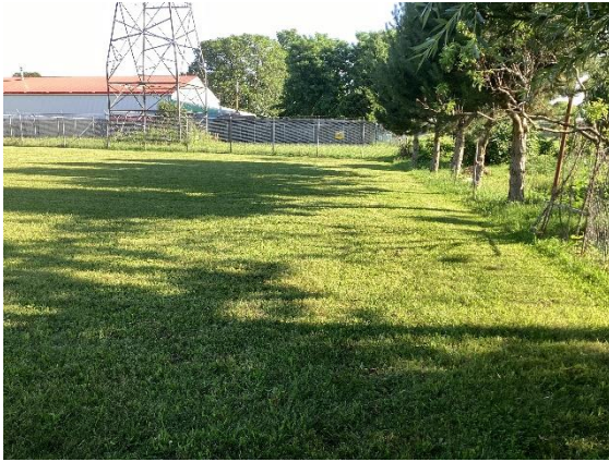
Photo 5: Manicured Lawn, Test Pit Surveyed at 5m Intervals, southeast corner looking north