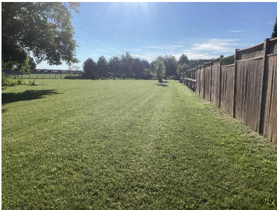
Photo 3: Manicured Lawn, Test Pit Surveyed at 5m Intervals, southeastern corner looking east