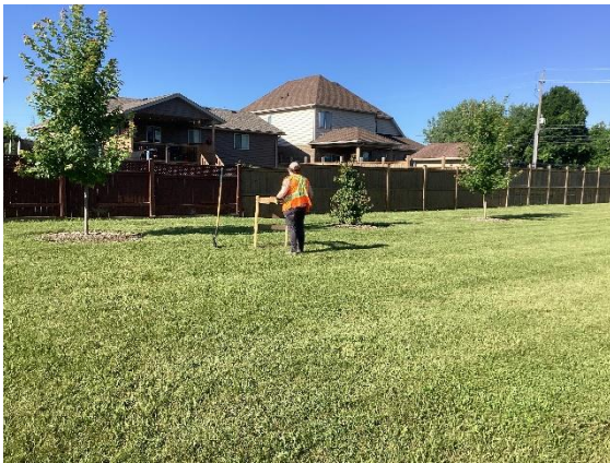
Photo 9: Manicured Lawn, Test Pit Surveyed at 5m Intervals, looking southwest