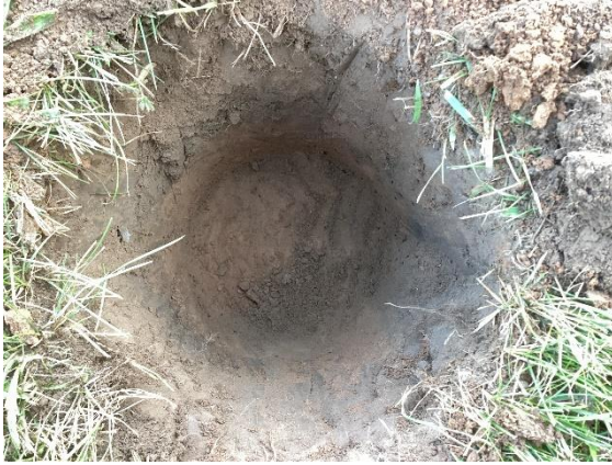
Photo 11: Sample Test Pit; Brown sandy topsoil, Light brown/orange sandy subsoil