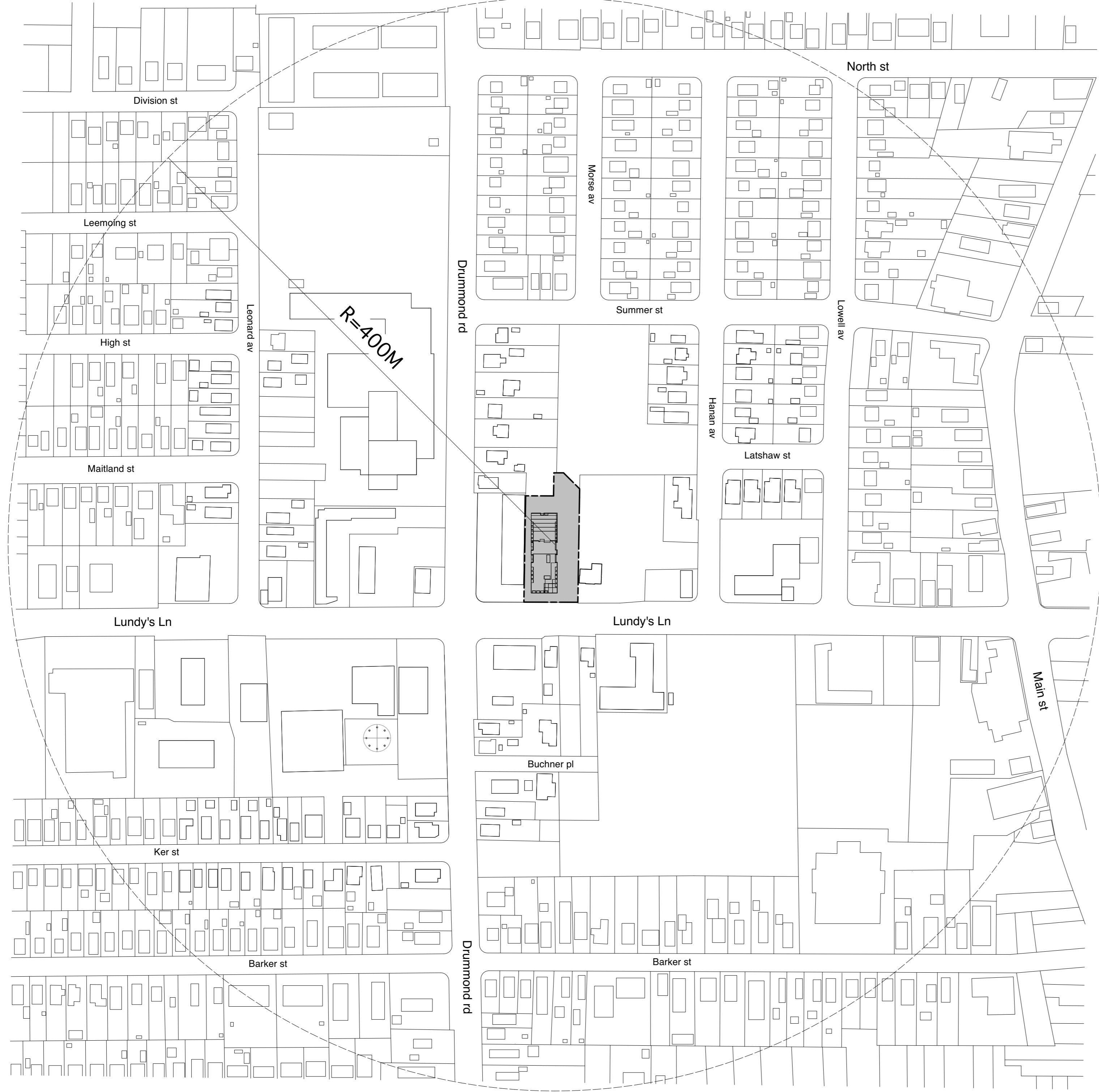
1 CONTEXT PLAN SP-0.1 Scale: 1:2000