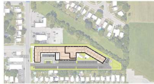
Site Plan - Shadow Study - March 21st 9:45 AM