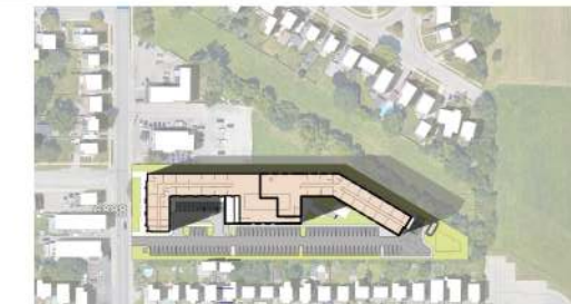
Site Plan - Shadow Study - September 10:00 PM