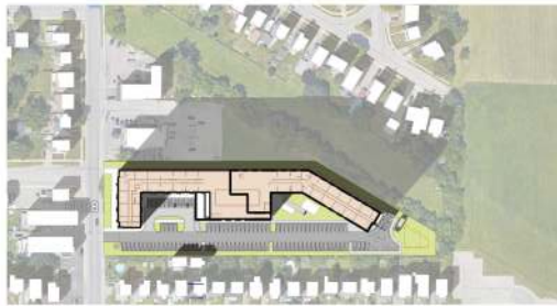
Site Plan - Shadow Study - December Time: 5:00 pm 1:100