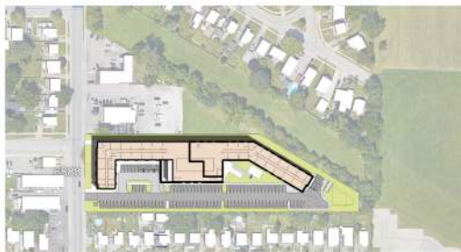
Site Plan - Shadow Study - Area 219-B 1:500