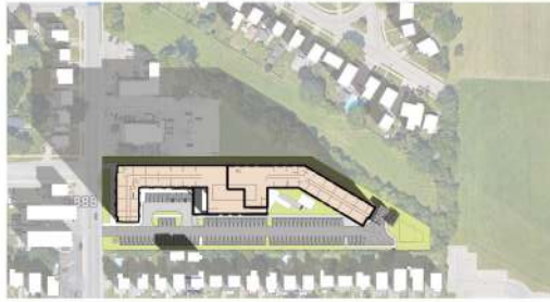
Site Plan - Shadow Study - December Time: 11:00 am 1:100