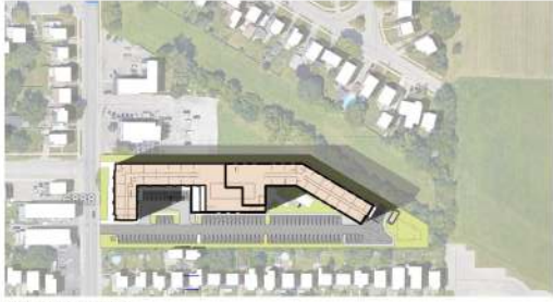
Site Plan - Shadow Study - March 21st 10:45 AM