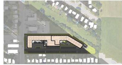
Site Plan - Shadow Study - December Time: 12:00 pm 1:100