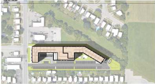
Site Plan - Shadow Study - September 7:00 PM