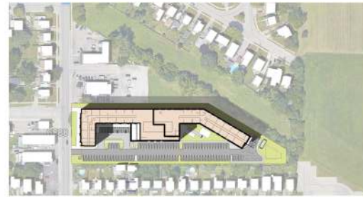
Site Plan - Shadow Study - March 21st 11:30 AM