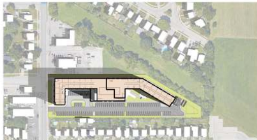
Site Plan - Shadow Study - September 2:00 PM