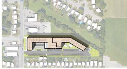
Site Plan - Shadow Study - March 21st 11:00 AM