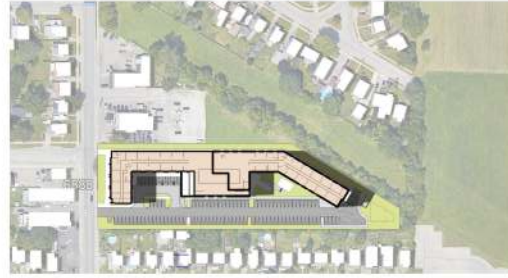
Site Plan - Shadow Study - Area 219-B 1:500