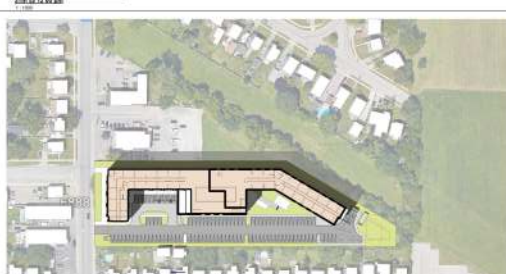
Site Plan - Shadow Study - September 8:00 PM