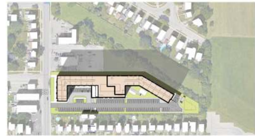
Site Plan - Shadow Study - December Time: 6:00 pm 1:100