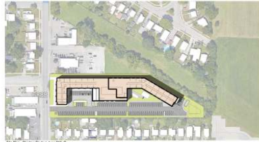
Site Plan - Shadow Study - Area 219-B 1:500