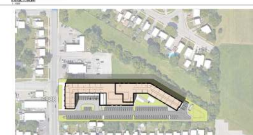
Site Plan - Shadow Study - September 9:00 PM