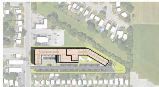
Site Plan - Shadow Study - Area 219-B 1:500