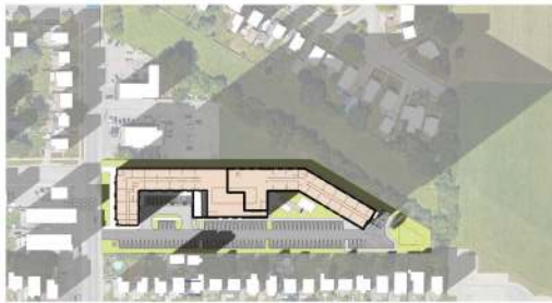
Site Plan - Shadow Study - December Time: 4:00 pm 1:100