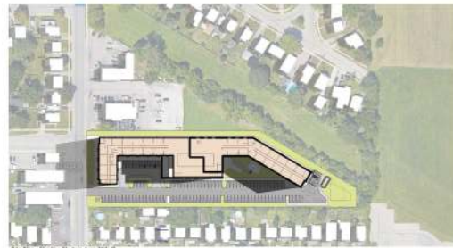
Site Plan - Shadow Study - Area 219-B 1:500