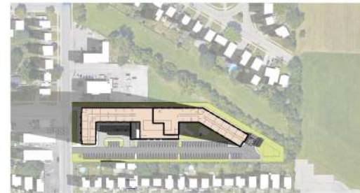
Site Plan - Shadow Study - September 3:00 PM