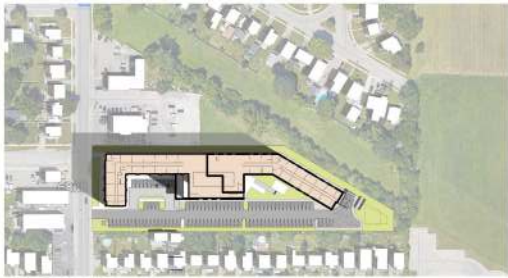
Site Plan - Shadow Study - March 21st 9:15 AM