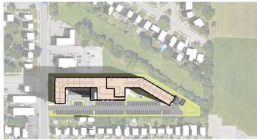
Site Plan - Shadow Study - March 21st 9:30 AM