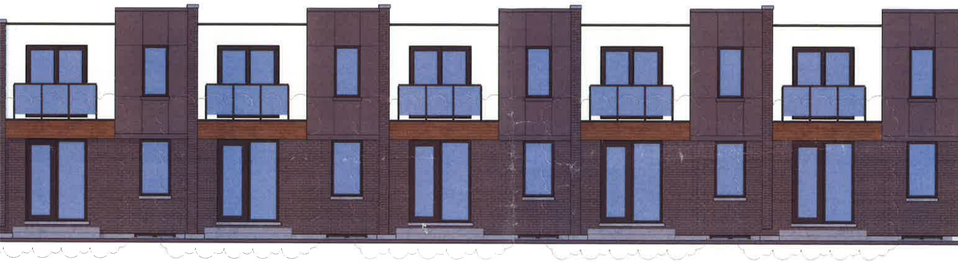
MONTROSE ROAD ELEVATION