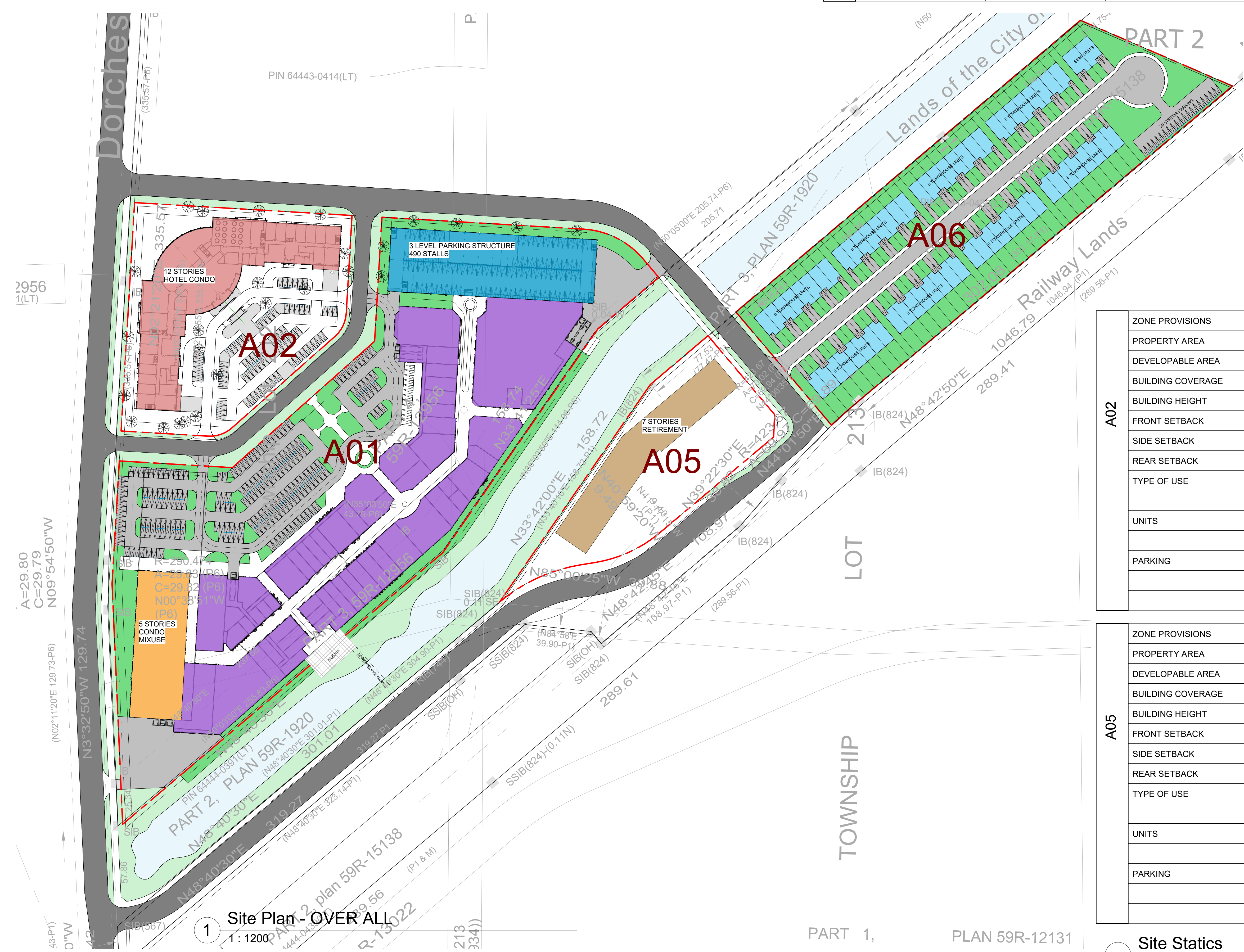
1 Site Plan - OVER ALL 1:1200

Note: This drawing is the property of the Architect and may not be reproduced or used without the expressed consent of the Architect. The Contractor is responsible for checking and verifying all levels and dimensions and shall report all discrepancies to the Architect and obtain clarification prior to commencing work.