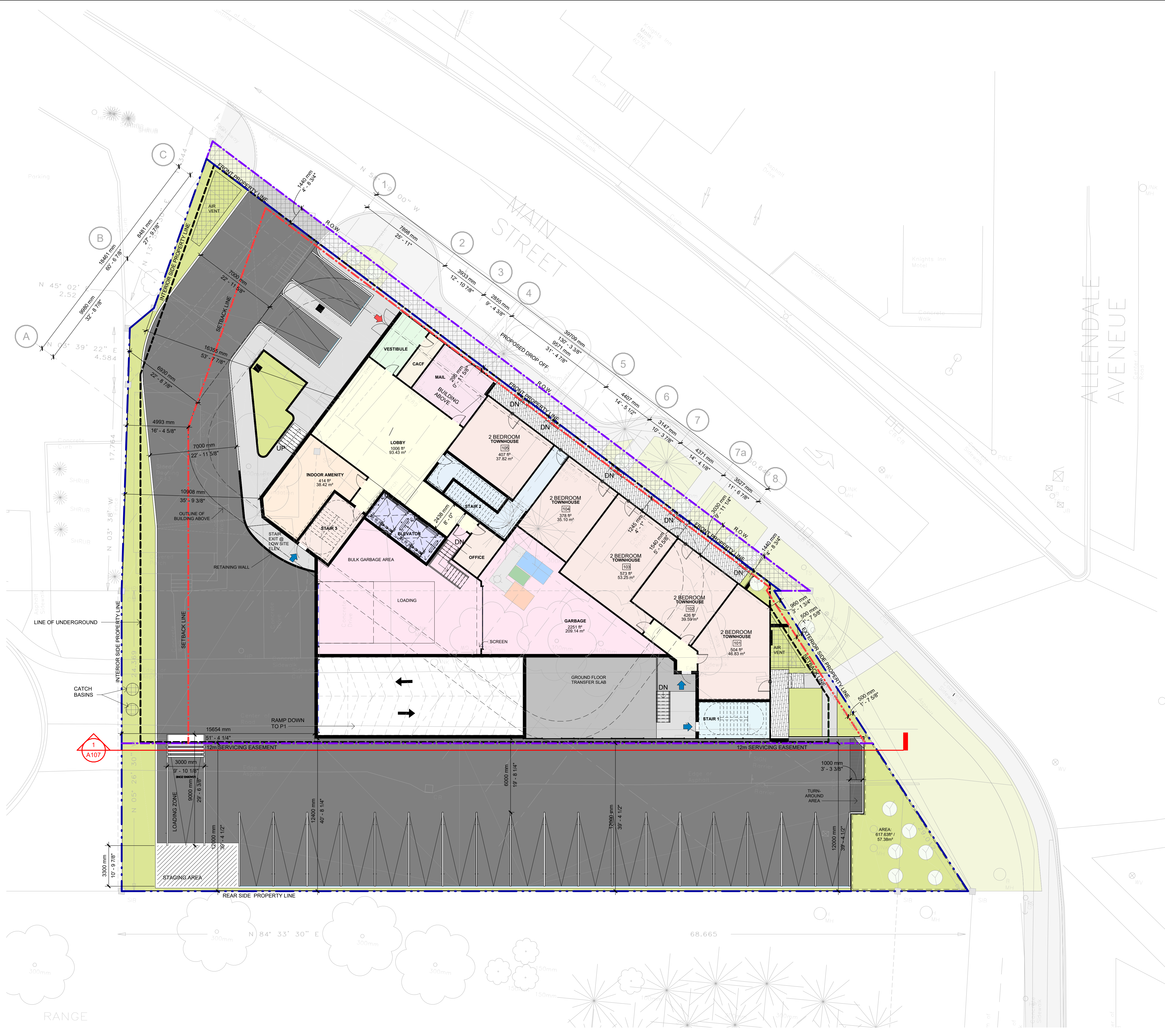
GROUND FLOOR PLAN A-101 1 : 150