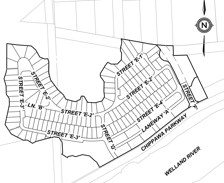
KEY PLAN SCALE 1:5000