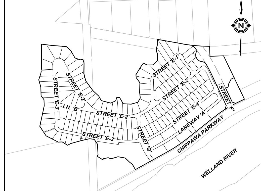
KEY PLAN SCALE 1:5000