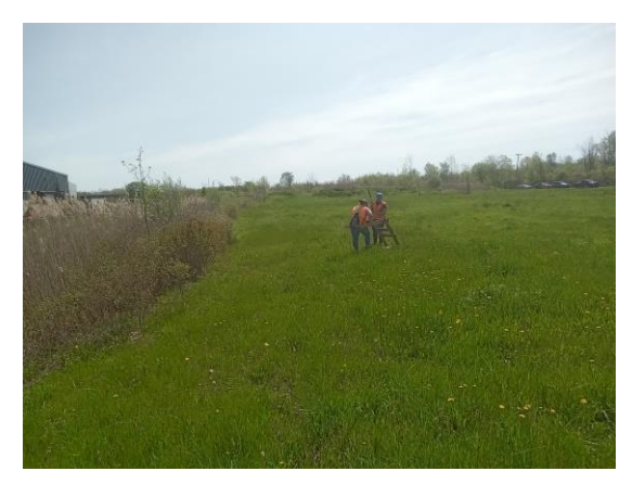
Photo 12: Disturbed Piles of Gravel and Dirt Not Assessed; facing northwest