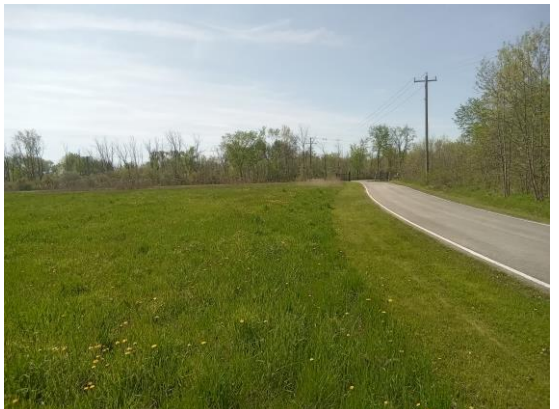
Photo 11: East Property Boundary; Disturbed Piles of Gravel and Dirt Not Assessed; facing northwest

Photo 10: North Property Boundary; Test Pit Surveyed at 5m Intervals, facing east