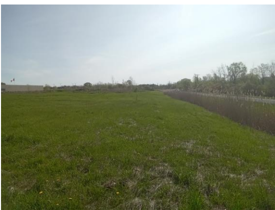
Photo 6: Manicured Lawn Surveyed at Test Pit Surveyed at 5m Intervals, facing east