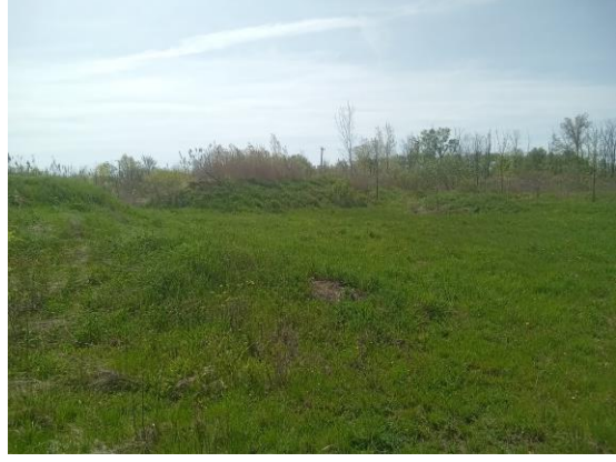
Photo 10: North Property Boundary; Test Pit Surveyed at 5m Intervals, facing east

Photo 8: Disturbed Piles of Gravel and Dirt Not Assessed; facing southeast