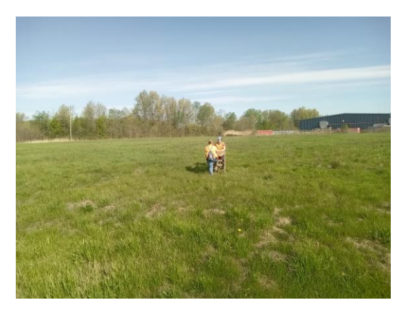
Photo 5: West Property Boundary; Test Pit Surveyed at 5m Intervals, facing north