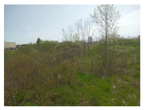
Photo 9: West Property Boundary; Test Pit Surveyed at 5m Intervals, facing south

Photo 8: Disturbed Piles of Gravel and Dirt Not Assessed; facing southeast