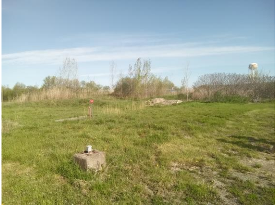
Photo 4: South Property Boundary; Manicured Lawn Surveyed at 5m Intervals; facing east