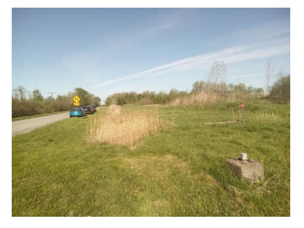
Photo 3: Manicured Lawn Test Pit Surveyed at 5m Intervals, facing north

Photo 1: South Property Boundary; Disturbed Piles of Gravel and Dirt Not Assessed; facing west