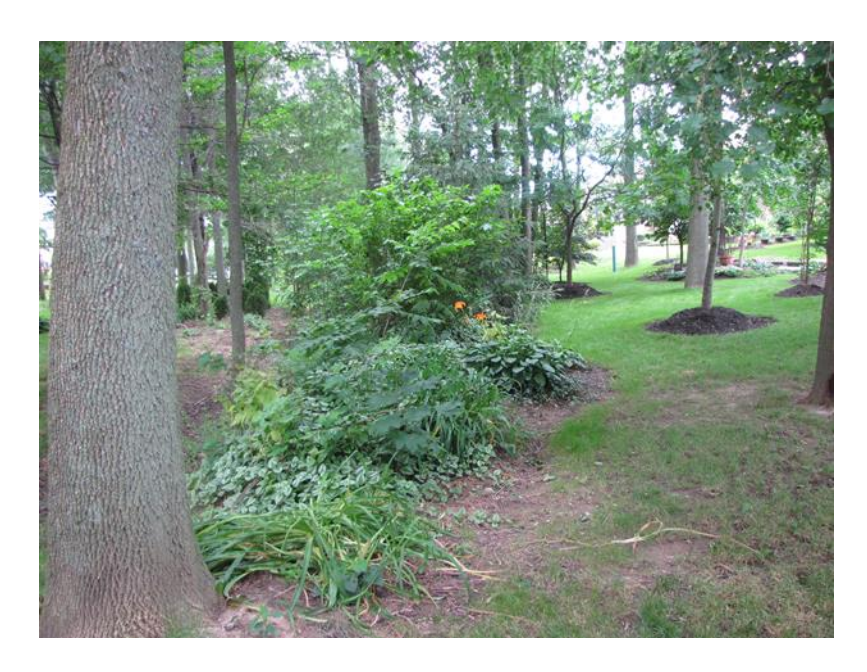
Figure 2- Planting of non-native species.