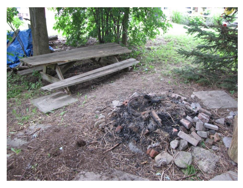
Figure 4- Another example of encroachment.