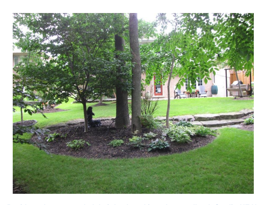
Figure 3- Residents have extended their backyard into the woodland.