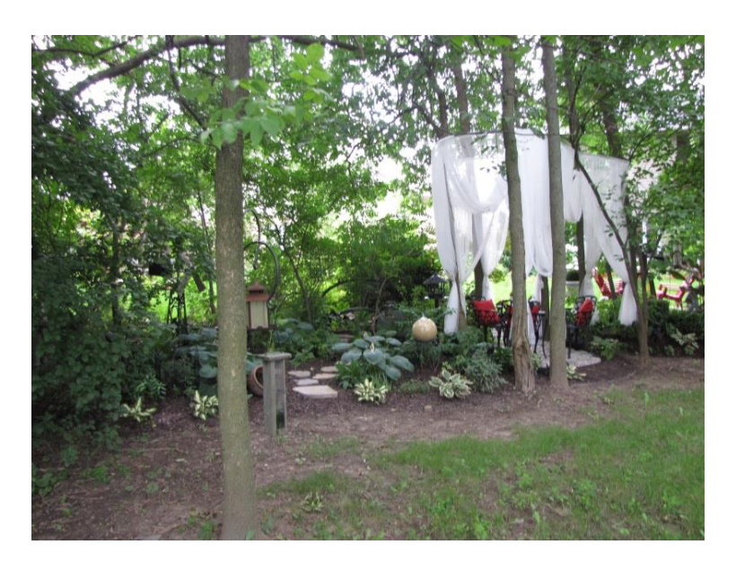
Figure 1- Encroachment.