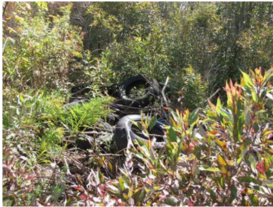
Figure 2- Tires that have been dumped.