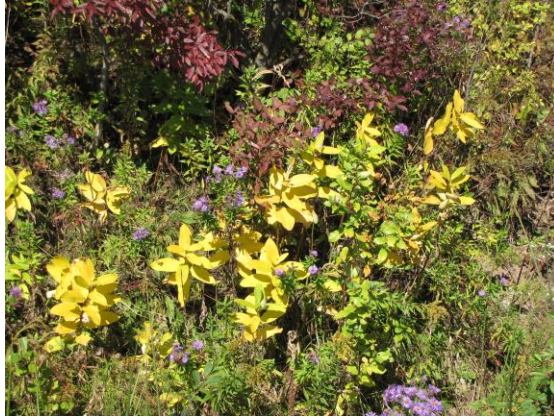
Figure 1- Dense vegetation.