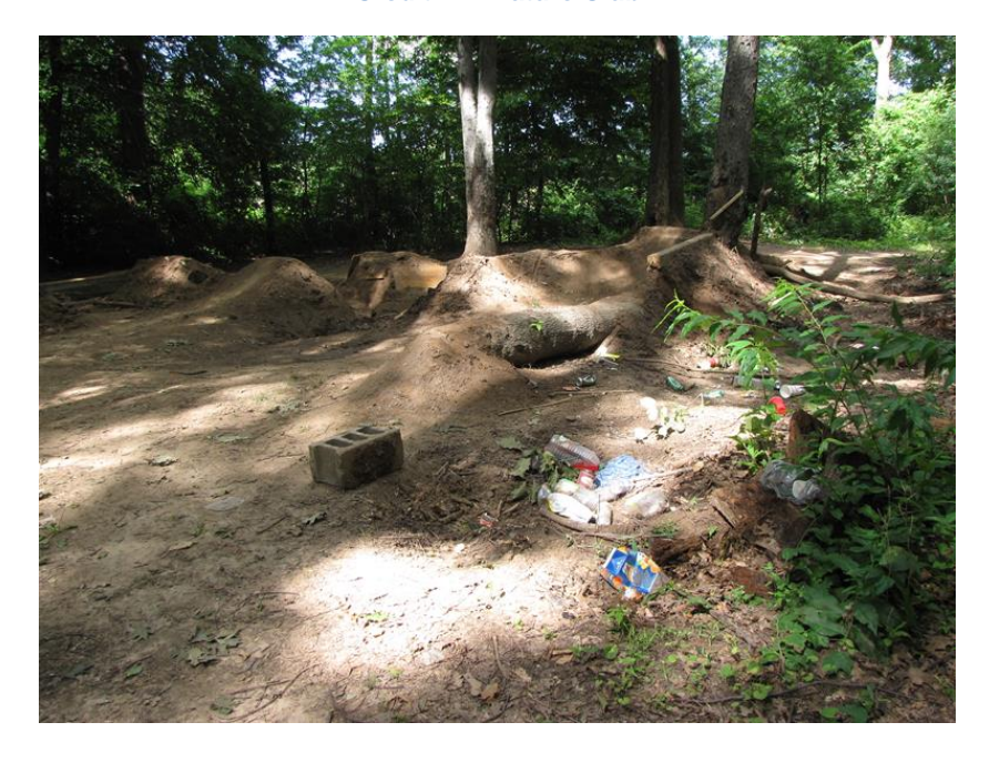
Figure 2- Bike ramps and garbage in Weaver Park.