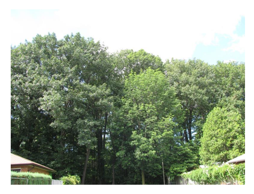
Figure 1- The Canopy of Tall Trees, especially the Red Oak, is a major attraction of Weaver Park.