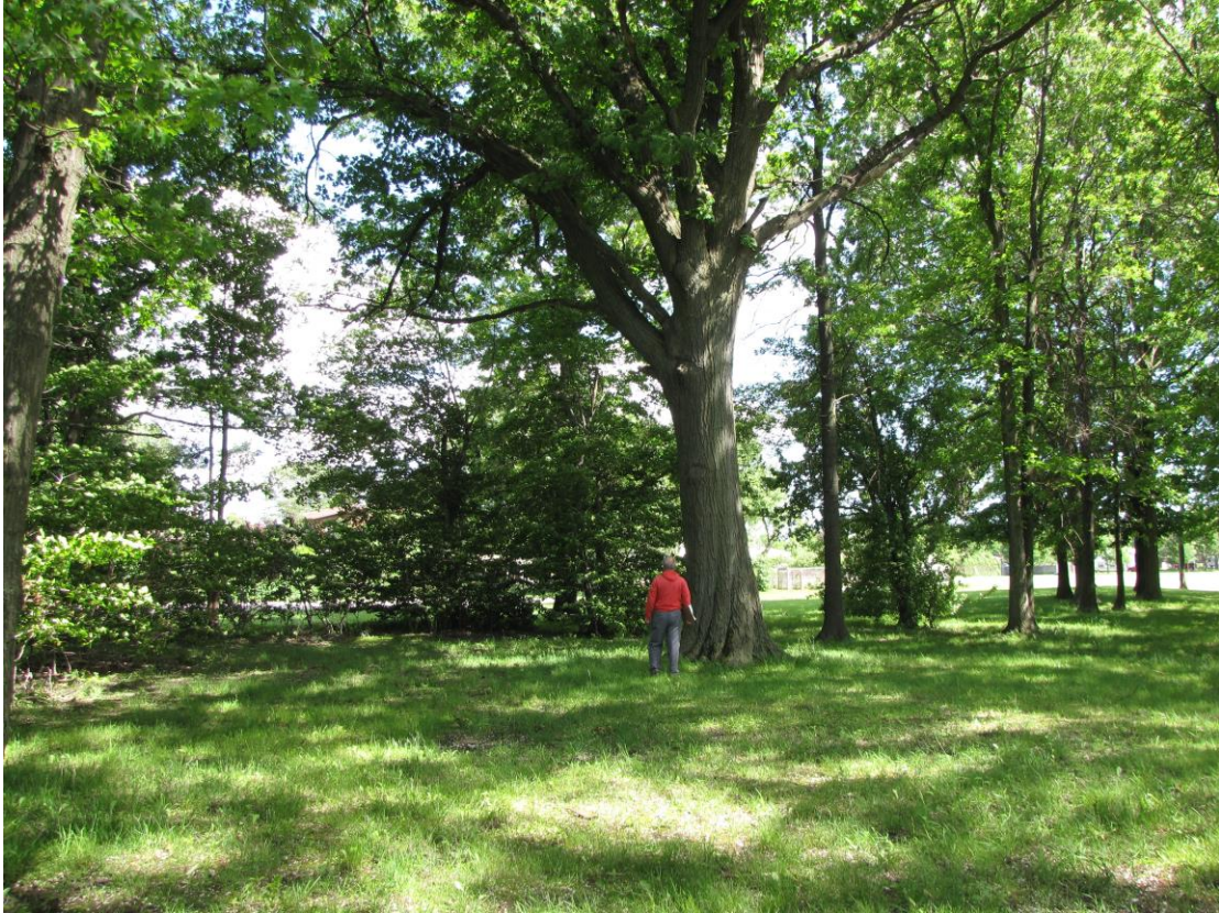
Figure 1- Polygon 1 area.